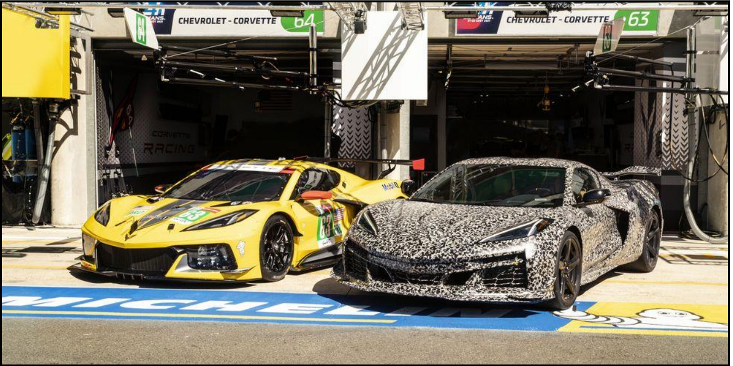
A C8.R race car is shown next to a camouflaged Z06

Earlier this summer, it was announced that the 2023 Corvette Z06 would be revealed this fall, and now we have a date! The 2023 Chevrolet Corvette Z06 is set to be revealed on October 26, 2021.