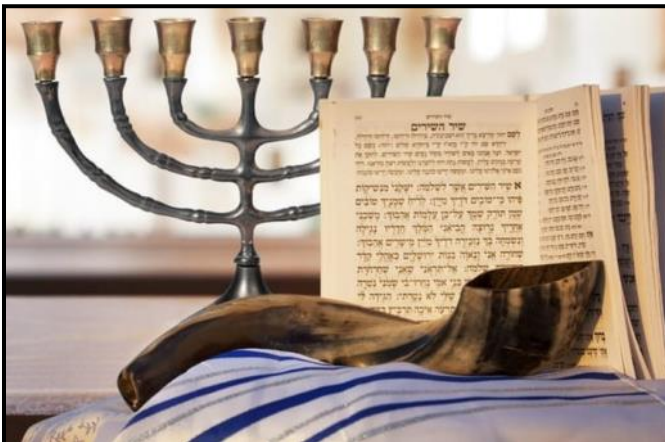
Yom Kippur Day September 15th