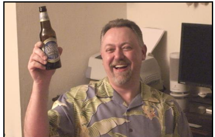
National Drink Beer Day September 28th