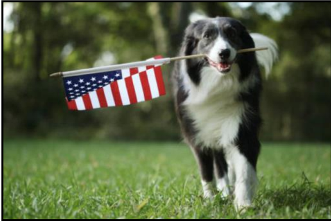
Labor Day September 6th