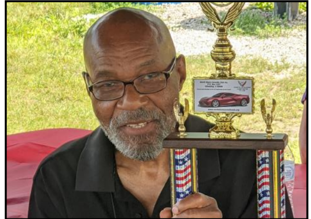
Grandparents Day September 12th