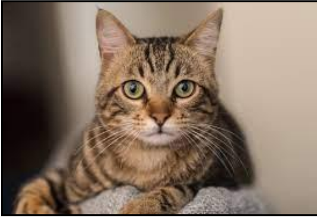
International Cat Day August 8th