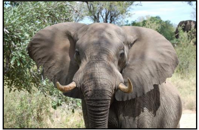
World Elephant Day August 12th