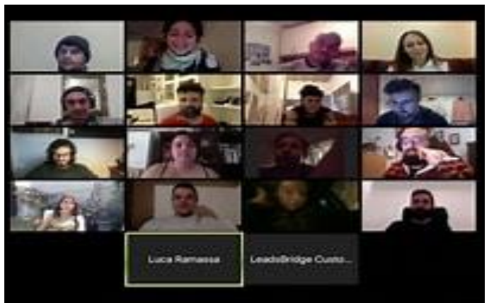
Membership Meeting at Ferrari Lake Forest and on Zoom August 18th