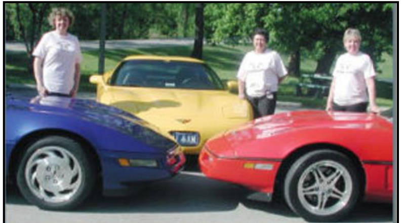
Women's Equality Day August 26th