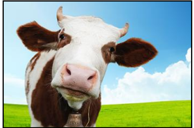
Cow Appreciation Day July 13th