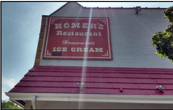
National Ice Cream Day July 18th