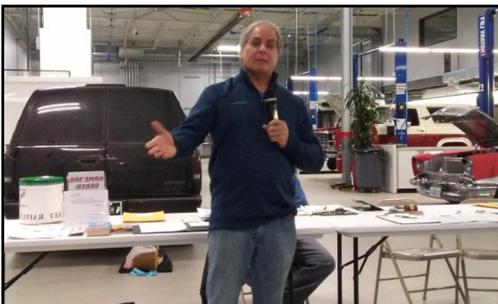
Membership Meeting In-Person at Blackdog and on Zoom July 21st