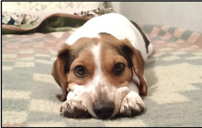
Pet Photo Day July 11th