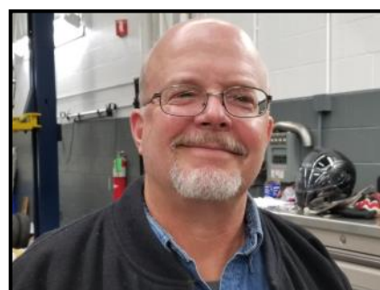
Eric Kirchner - Governor