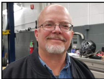
Eric Kirchner - Governor