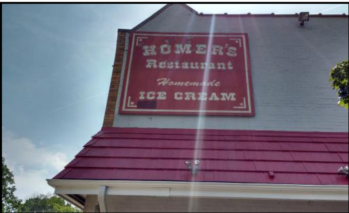
Ice Cream Soda Day June 20