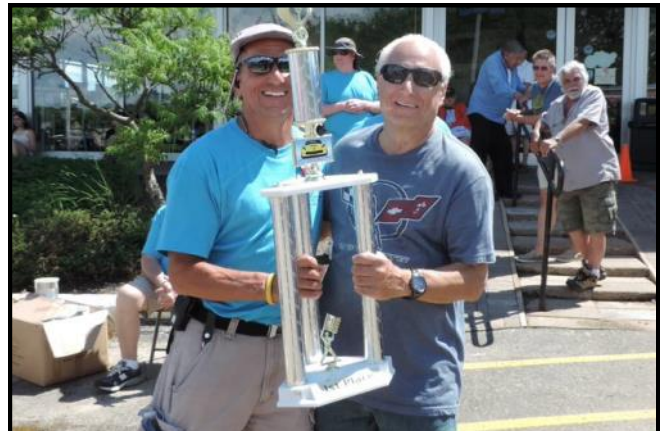
Sun Glasses Day June 27