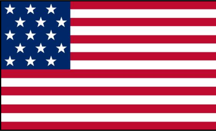
Flag Day June 14