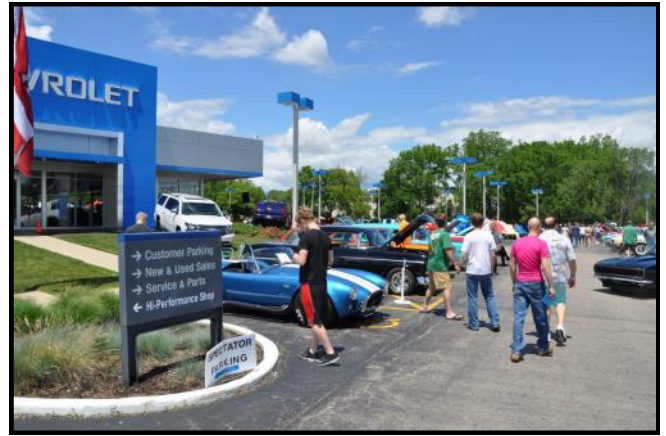
Father's Day June 20